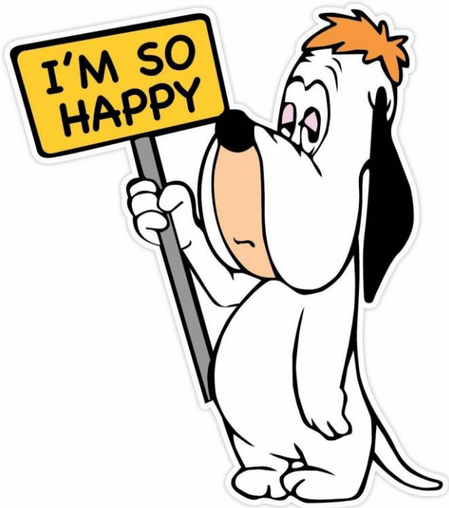
Figure 1: Droopy Dog with its iconic quote.