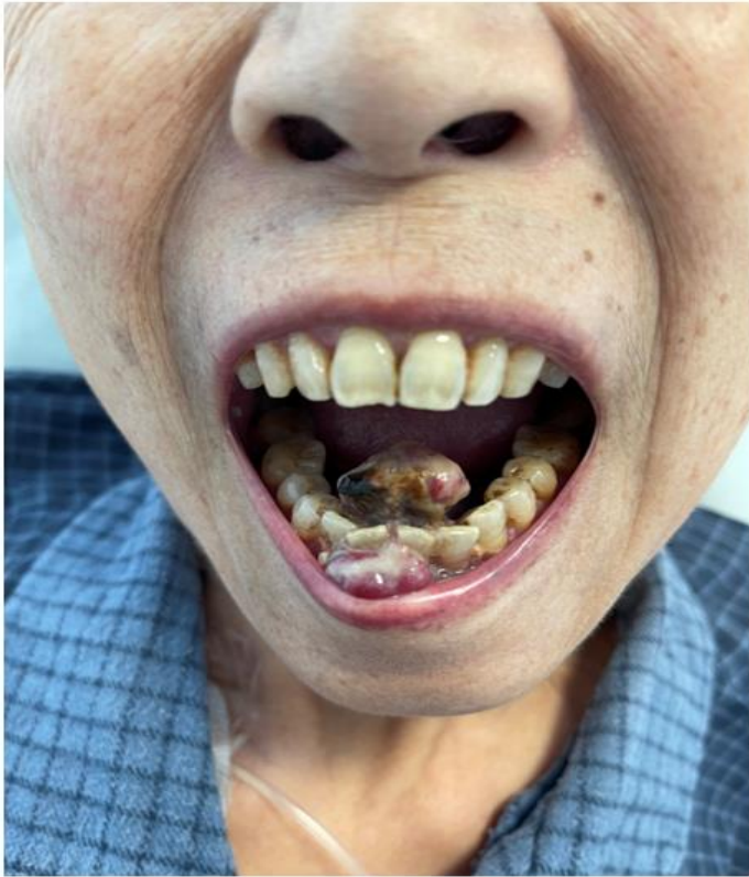
Figure 1: Image showing the gingival metastatic tumor. A reddish and friable gingival mass, originating on both sides of the lower gingiva opposite the insertion of the incisors