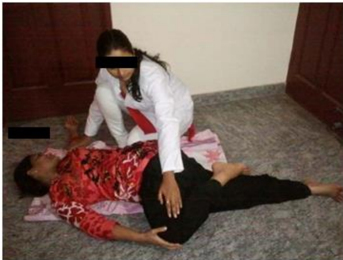
Fig no.3: Suptamatsyendrasana