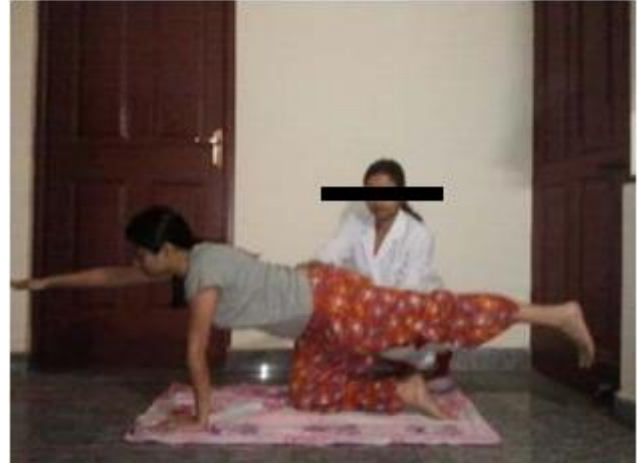
Fig no. 4: Bird-Dog Exercise