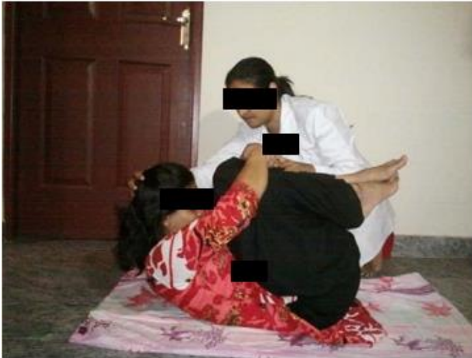
Fig no 2: Pawanmuktasana