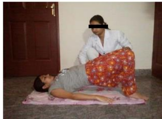
Fig no.5: Bridging

The first session of both yoga and core stabilization exercises supervised, to make sure that the subjects have understood the technique of performing their respective asanas and exercises.