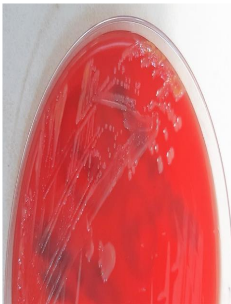
Figure I: S. paucimobilis culture on blood agar showing yellow-pigmented colonies.

The sample from pus was cultured at 35 °C for 24-hours and yielded yellow-pigmented, smoothed, convex, non- haemolytic, oxidase- and catalase-positive colonies, growing on blood agar (Figure I) and chocolate agar plates, but not on McConkey agar plate.