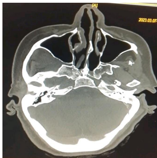
Figure 2: CT image showing infiltration of the jugal soft tissues, with integrity of the bone structures opposite.