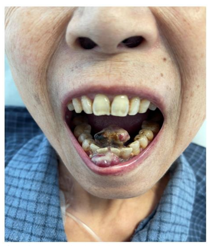
Figure 1: mage showing the gingival metastatic tumor. A reddish and friable gingival mass, originating on both sides of the lower gingiva opposite the insertion of the incisors